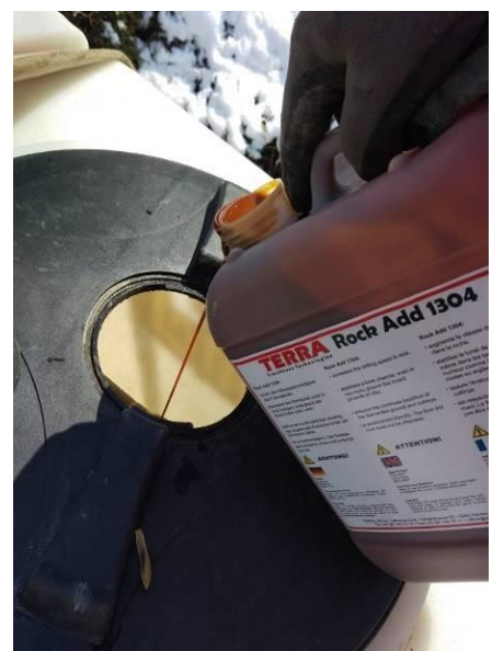
Pic. 3: Mixing of the additive "Rock Add 1304"