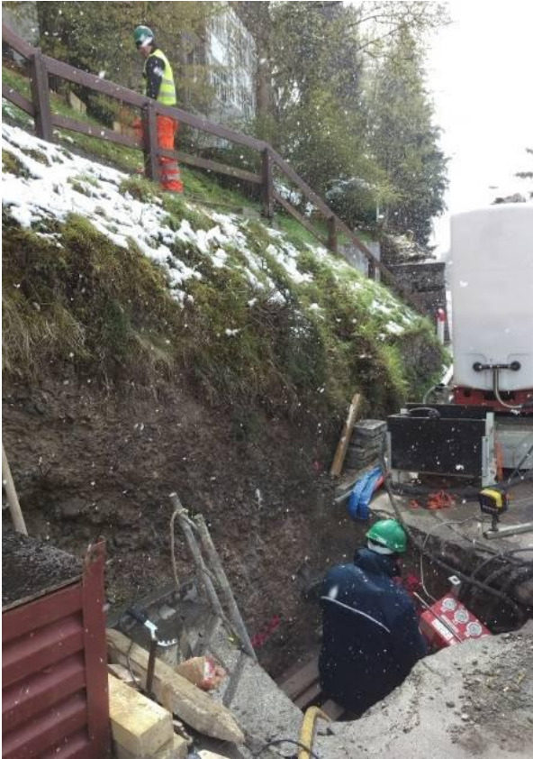
Pic. 4: View onto the drill path