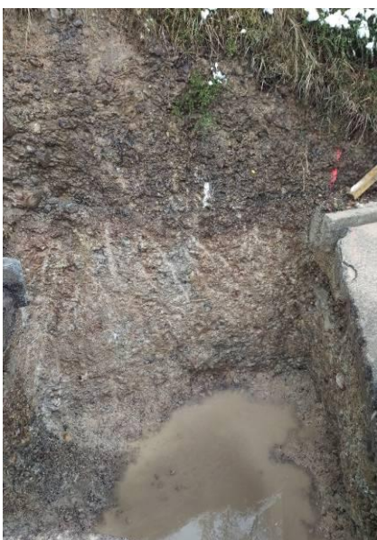
Pic. 1: View into the starting pit

Rock Add 1304 is environment friendly. The fluid drill mud must not be disposed.