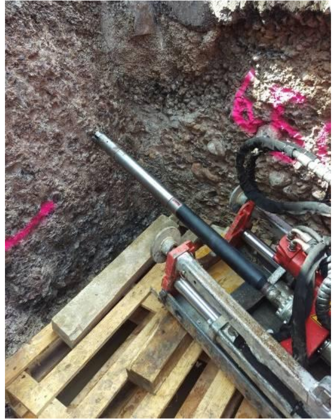
Pic. 5: Start of the pilot bore