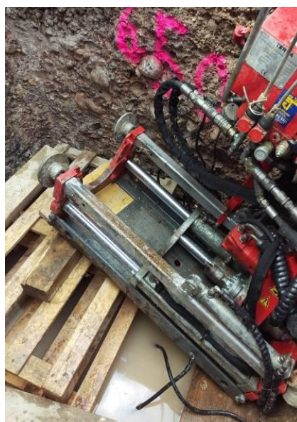
Pic. 2: Installation of the pit machine into the starting pit