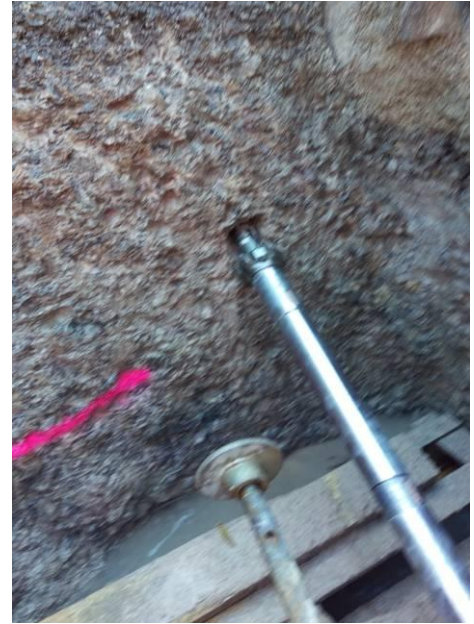
Pic. 9: These cuttings are broken by the TERRA-ROCK 65, mixed with the drilling fluid and blown backwards by the blow-out adapter along the 20 m (66 ft) long bore channel.