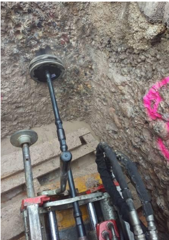
Pic. 6: The split rod wiper prevents that the pit machine gets dirty by the blown out cuttings.