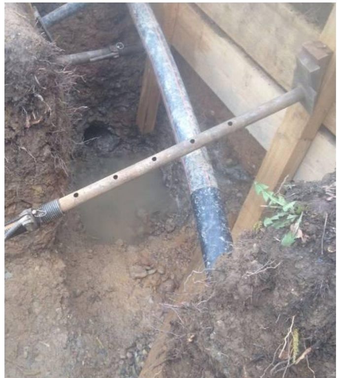
Pic. 7: The pilot bore has reached the target pit. The TERRA-ROCK is disassembled and prepared for the hole opening.