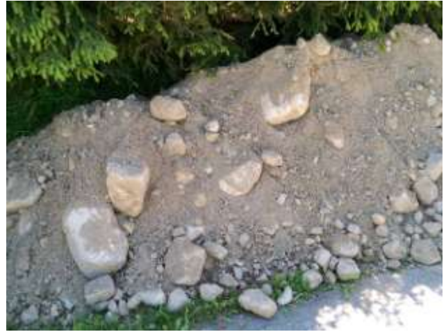
Pic. 3: Mixed underground conditions are often a challenge for every bore. In these 300 road crossings in Raufoss conditions changed from gravel to boulders and rock. This is exactly the terrain where the TERRA-ROCK 65 - an air-liquid down-the-hole-drilling system - can show its advantages at its best.