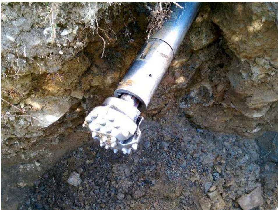
Pic. 1: TERRA-ROCK 65 through mixed ground conditions

The TERRA MINI-JET MJ 1600 can be used for rock drilling as well as for soft undergrounds. In soft underground steered bores are possible up to a minimum radius of 15 m.