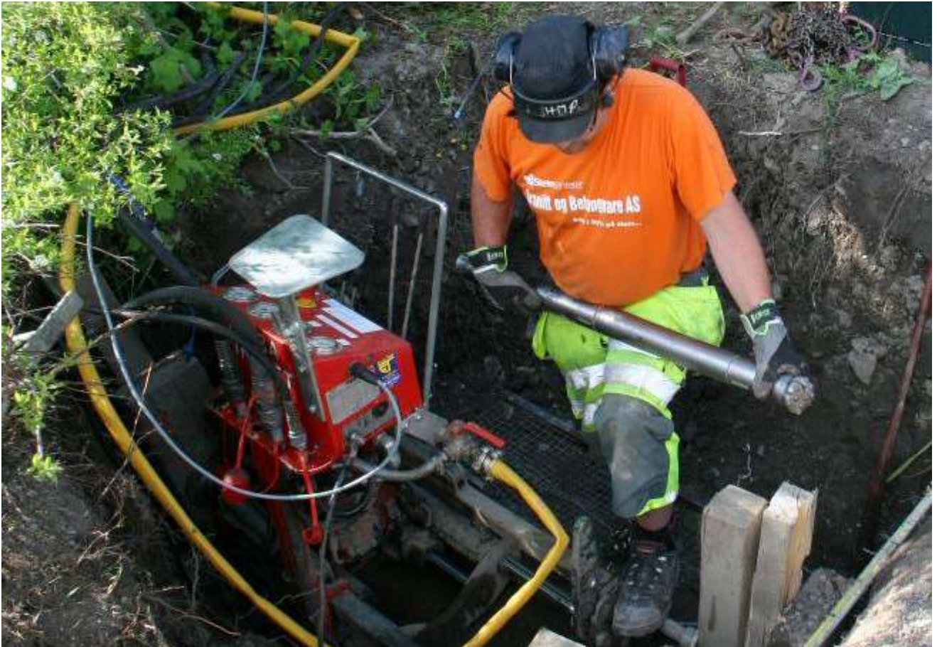
Pic. 4: The operator sets up the MINI-JET MJ 1600 in the starting pit. The air percussion hammer TERRA-ROCK 65 is driven by minimum 4 m 3 /min air at minimum 8 bar (ideally 14 bar).