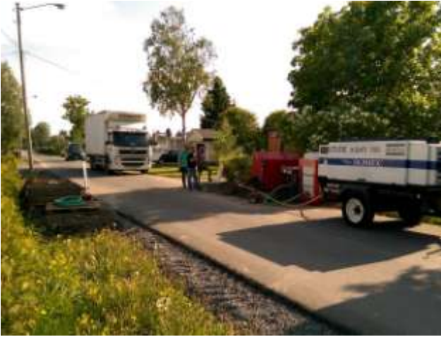
Pic. 2: 300 of roads like this had to be under passed to install pipes for fiber optics cable. The length of the bores varied from 7 m to 18 m.