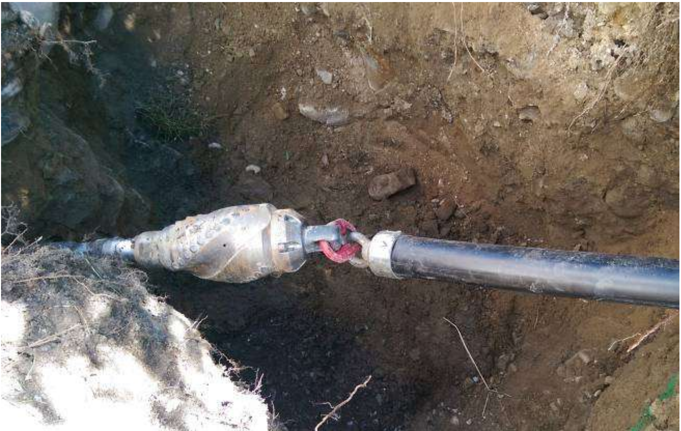
Pic. 6: Pipe installation with the 115 mm reamer.

Alternatively and ideally these three units are fix installed on a pick-up truck or trailer, which needs to be placed nearby the pit during drilling.