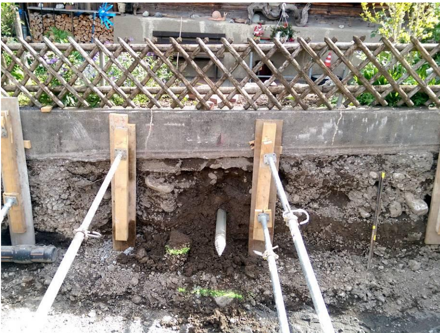
Pic 3: The T 105 F reaches the target with precision and at ease.

The company Gerber + Troxler Bau AG from the Bernese Oberland is rehabilitating the drinking water system. For the trenchless installations, especially house connections, the new piercing tool TERRA-HAMMER T 105 F was used. With the oversized end sleeve the 105 mm machine also allows pulling in of bigger pipes as in this case a 112 mm short pipe. The piercing tool was set up in the natural stone masonry within the basement. From there it drilled and installed simultaneously the protective pipes underneath the 7 m backyard. Into these protective pipes will then be installed the product pipe.