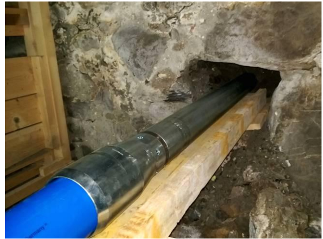
Pic 2: The oversized end sleeve expands the bore channel to 130 mm.

The company Gerber + Troxler Bau AG from the Bernese Oberland is rehabilitating the drinking water system. For the trenchless installations, especially house connections, the new piercing tool TERRA-HAMMER T 105 F was used. With the oversized end sleeve the 105 mm machine also allows pulling in of bigger pipes as in this case a 112 mm short pipe. The piercing tool was set up in the natural stone masonry within the basement. From there it drilled and installed simultaneously the protective pipes underneath the 7 m backyard. Into these protective pipes will then be installed the product pipe.