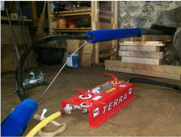
Pic 1: Installation of the piercing tool and the short pipes in the basement before starting the machine.